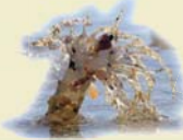
Lanice Lanice conchylega