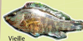
Vieille Labrus bergylta