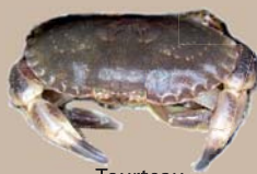
Tourteau Cancer pagurus