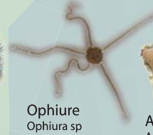
Ophiure Ophiura sp.