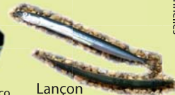
Lançon Ammodytes tobianus