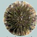
Oursin des rochers Psammechinus miliaris