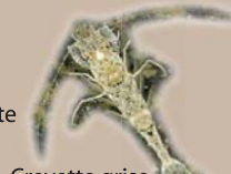
Crevette grise Cragon crangon