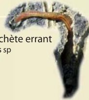
Polychète errant Nereis sp.