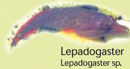
Lepadogaster Lepadogaster sp.