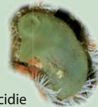
Ascidie Ascidia conchilega