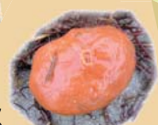
Ficuline Suberite sp.