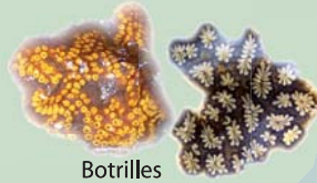
Botrilles Botryllus sp.