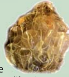
Claveline Clavelina lapadiformis