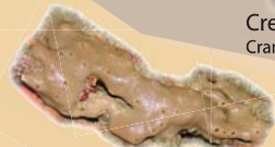
Eponge mie de pain Halichondria panicea