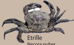
Etrille Necora puber