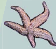
Etoile de mer glaciale Marthasterias glacialis