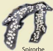
Spirorbe Spirorbis sp.