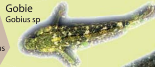
Gobie Gobius sp.